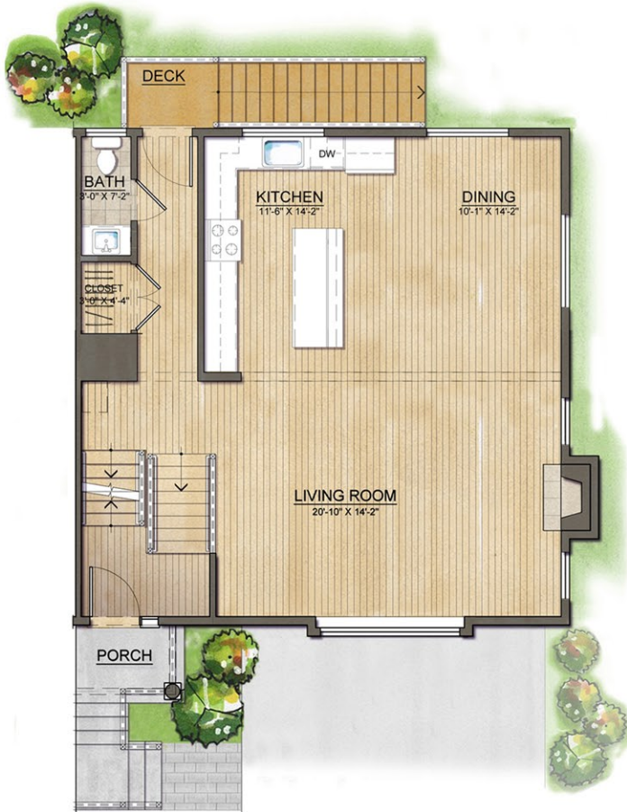
FIRST FLOOR OPTION 1