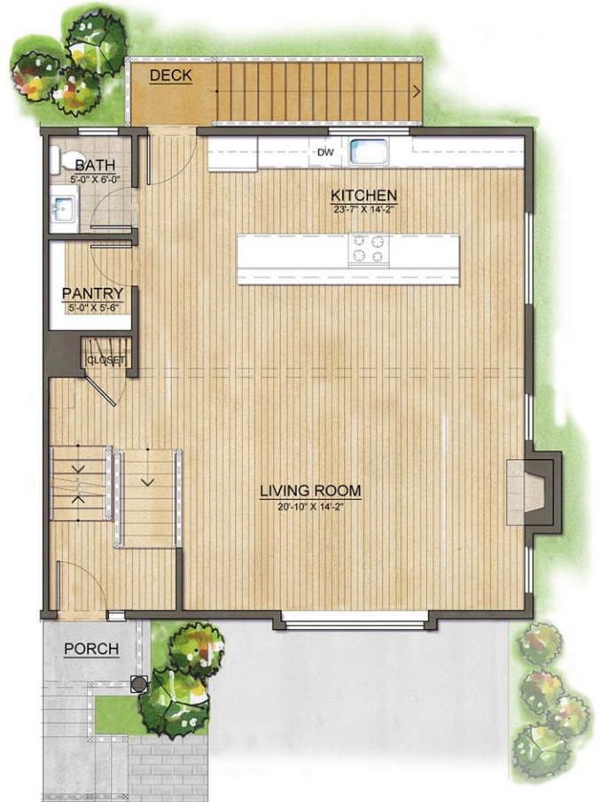
FIRST FLOOR OPTION 2